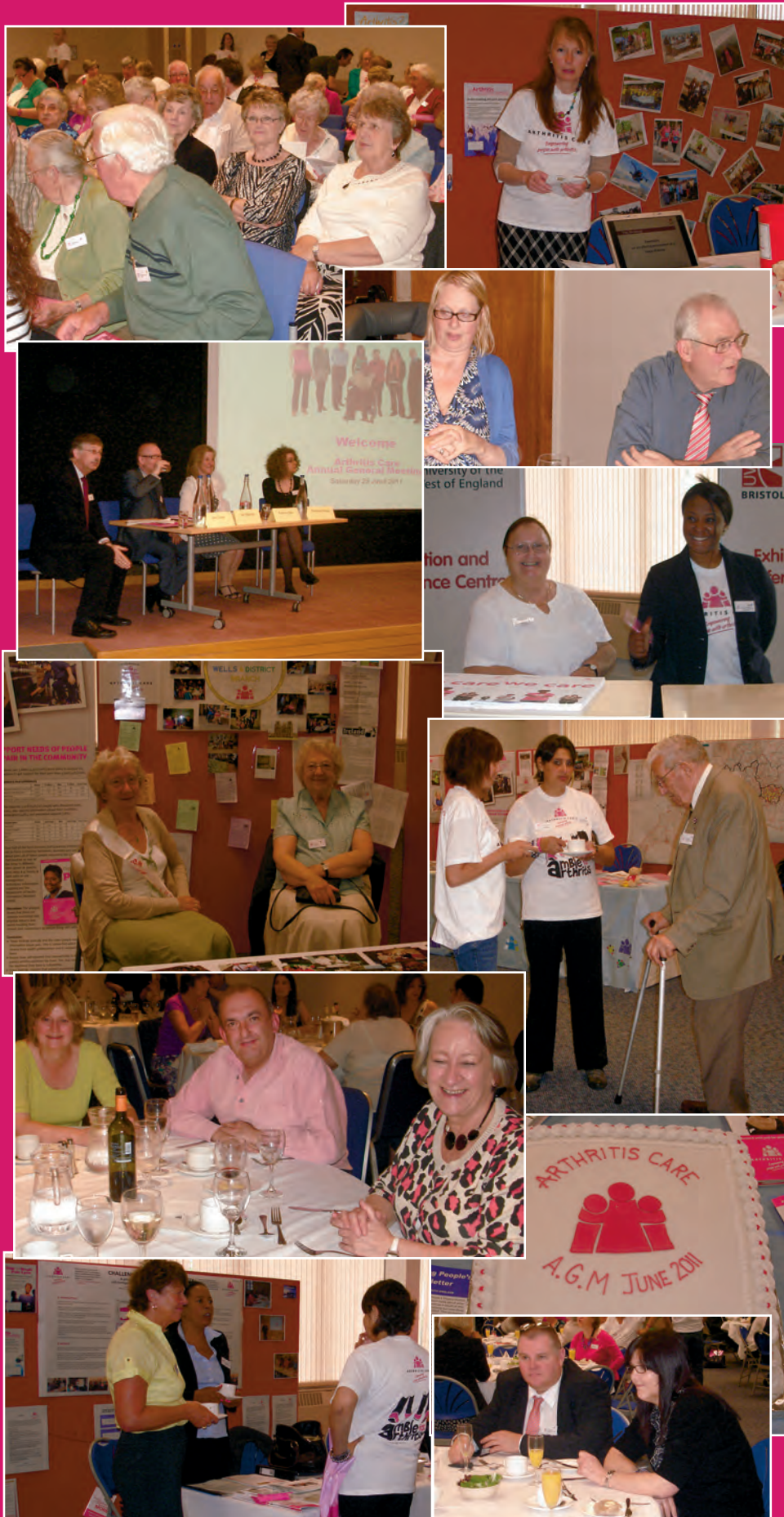
Arthritis Care's AGM in June was hosted by the South England region this year at the University of the West of England in Bristol. There was a good turnout of people from across the UK, and an excellent showcase of information stands and presentations throughout the day.