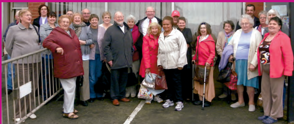
Members of the Amesbury branch enjoying the sea air in Blackpool