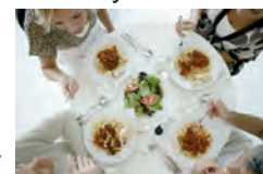
Fundraising dinner parties are a popular new idea

It's not long until Christmas, so what about holding a Christmas coffee morning in a local hall where you could serve mince pies, have some stalls and maybe raffle a festive hamper? Or why not organise a quiz evening? Another simple idea is inviting some friends round for dinner and asking for a donation to Arthritis Care. If you are good at knitting, you could make some scarves and sell them. And don't forget, of course, our Ambles for Arthritis next May – organise one yourselves or join in one of the lovely walks we are currently planning across the south.