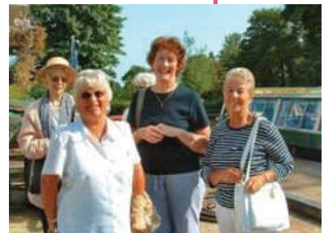
A Trip on the River Wey

'Arthritis is not something that 'you must just be prepared to live with' as many have been told in the past.'