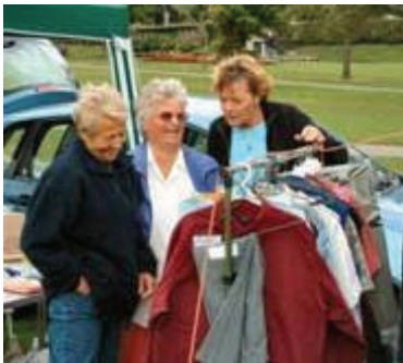
Fun at the Haywards Heath Fair

Arthritis Care Haywards Heath and District branch members are involved in a varied programme of meetings with different speakers and activities each