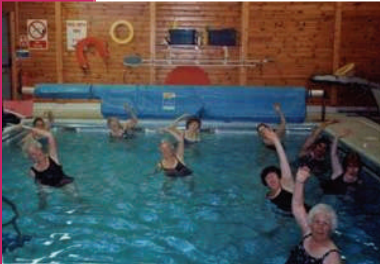
St. Albans branch hydrotherapy group

Above is a recent photograph taken at one of our successful hydrotherapy sessions held weekly at the very good pool at St. Albans City Hospital.